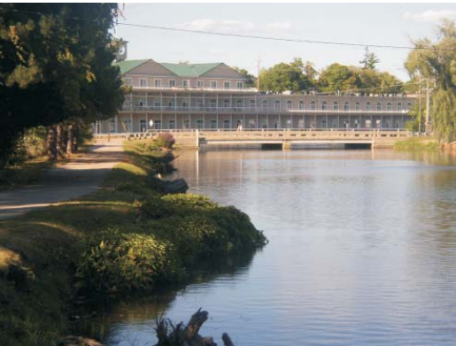
River walk view of Edgewater Apartments complex, which was formerly a wool mill.