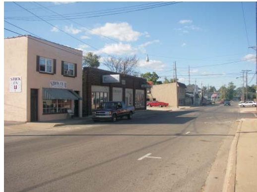
Downtown Development Authority (DDA) urban renovation priority.

Eaton Rapids has been home to mineral baths, Millers premium ice cream and wool mills that produced blankets for the troops in WW2 and Spaulding baseball innards for America's pastime.