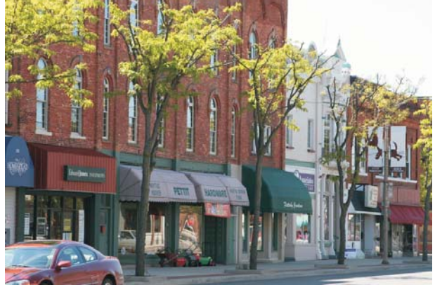
Petit's Hardware has served local residents for more than three generations on the east side of Main Street.